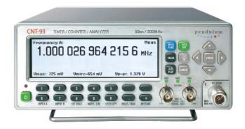
Figure 3: Input parameter setting menu shown with measured result.